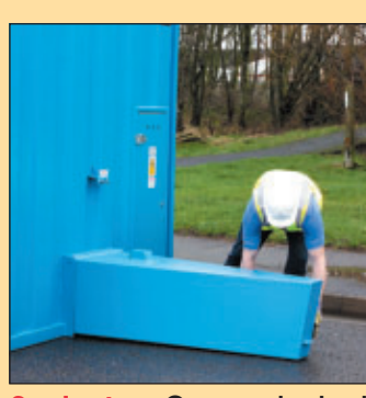
3 minutes: Canopy locked to protect towing facility

Easily towed, one man operation secured and manoeuvred on site, in less than 3 minutes. Its' many safety features make it a high secure and money saving choice of welfare unit for rental companies and contractors.