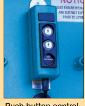
Push button control for hydraulics