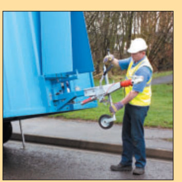
1 minute: unhitched from towing vehicle