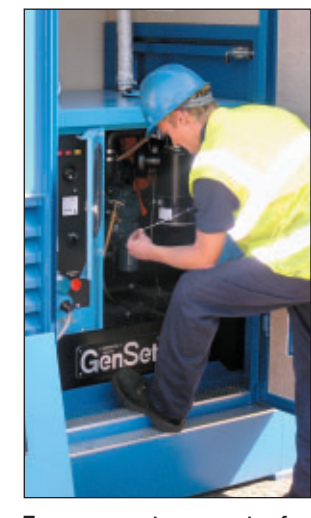
Easy access to generator for servicing and maintenance