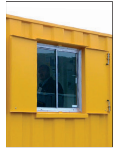
High security window shutters